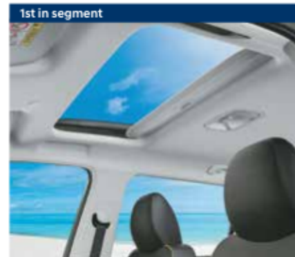
Voice enabled smart electric sunroof

When you get inside Hyundai EXTER, you know there is room for you as well as everything you love. Its spacious interiors have been crafted to offer utmost comfort, so every moment of your journey is exhilarating and you are all set for outside.