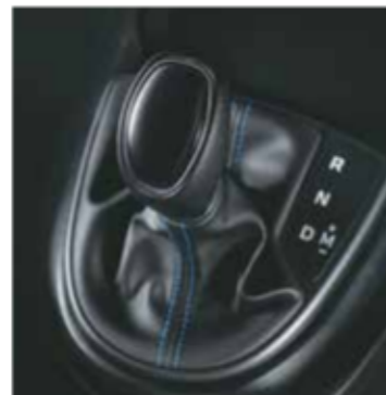
Automated manual transmission (AMT)