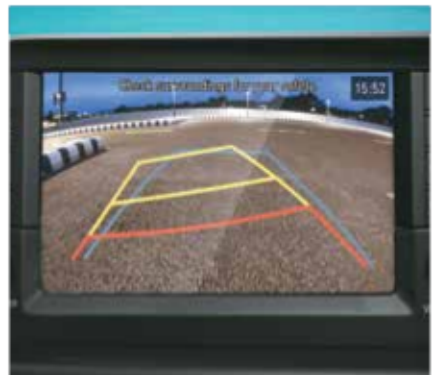
Rear view camera with dynamic guidelines