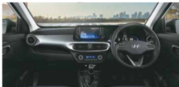
Black interiors with silver inserts