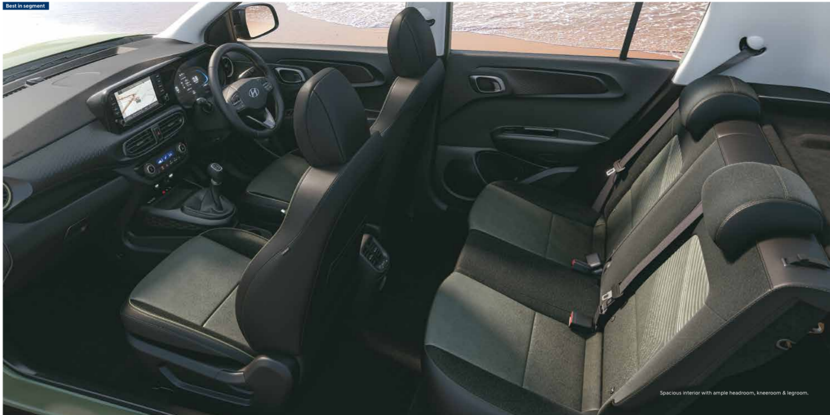
Spacious interior with ample headroom, kneeroom & legroom.