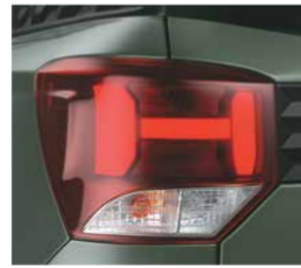
Signature H-LED tail lamps