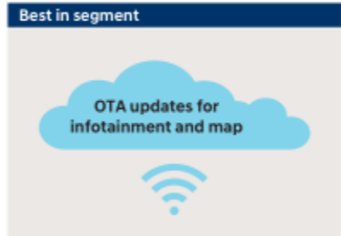
Over-the-air (OTA) updates for infotainment and map (16 free map updates in 8 years)