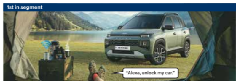
Home to car (H2C) with Alexa*** (English & Hindi)

Other features: On-board navigation (1 st in segment) | Smartphone connectivity - Android Auto and Apple CarPlay | C-Type USB charger (Best in segment) Embedded voice commands (92 nos.) | Steering wheel with audio & Bluetooth control