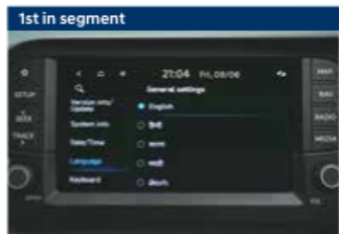
Multi-language UI support (12 nos.)