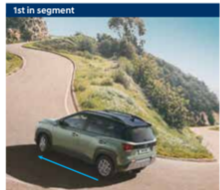
Hill-start assist control (HAC)