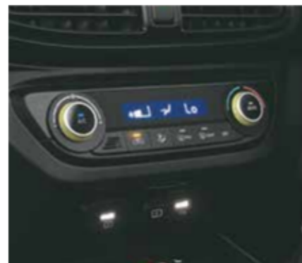
Fully automatic temperature control (FATC) with digital display