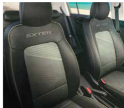
Sporty semi-leatherette upholstery