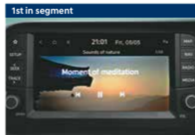
Ambient sounds of nature (7 nos.)