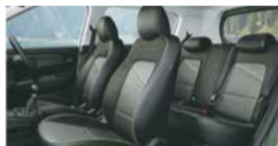
Light sage inserts