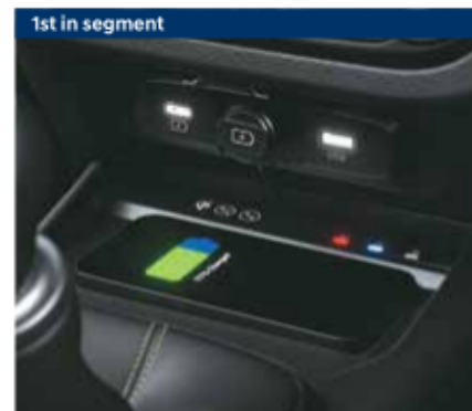
Wireless phone charger