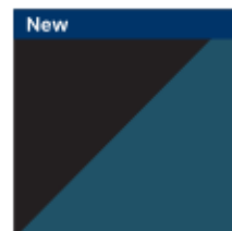
Cosmic blue with abyss black roof