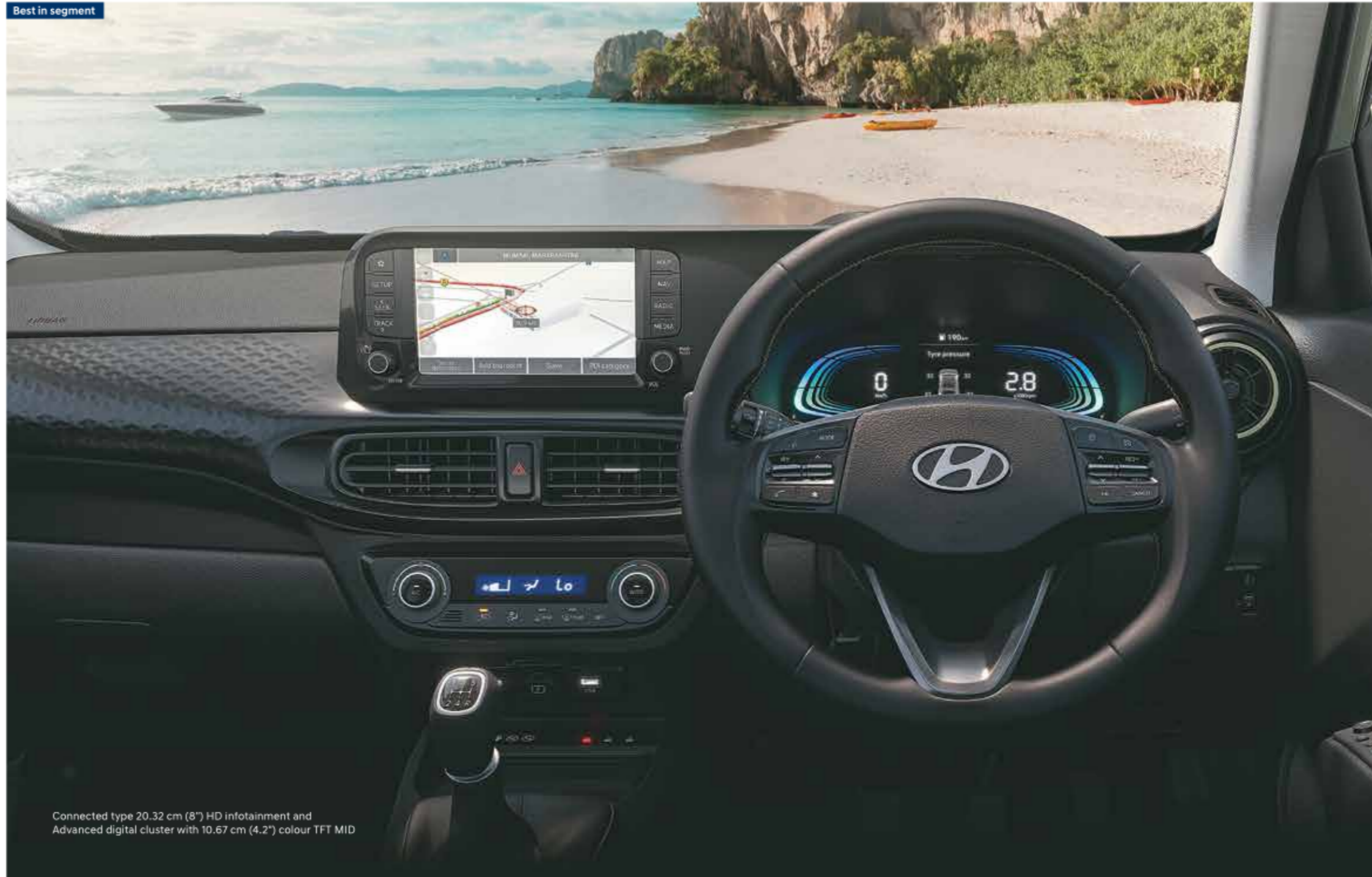
Connected type 20.32 cm (8") HD infotainment and Advanced digital cluster with 10.67 cm (4.2") colour TFT MID

Other features: On-board navigation (1 st in segment) | Smartphone connectivity - Android Auto and Apple CarPlay | C-Type USB charger (Best in segment) Embedded voice commands (92 nos.) | Steering wheel with audio & Bluetooth control