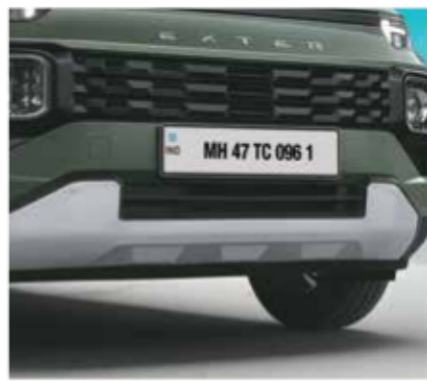
Parametric designed front grille Solid & wide front skid plate