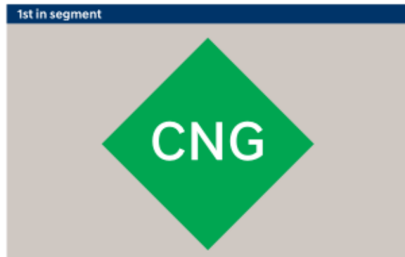
1.2 l Bi-fuel Kappa petrol with CNG