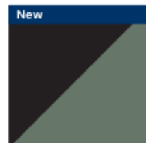
Ranger khaki with abyss black roof