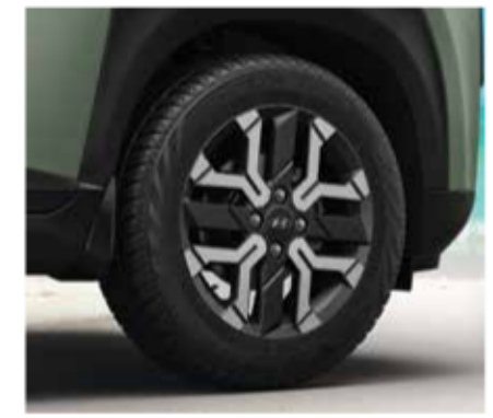
R15 (D=380.2 mm) Diamond cut alloy wheels