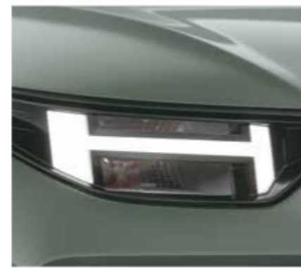
Signature H-LED DRLs and positioning lamps