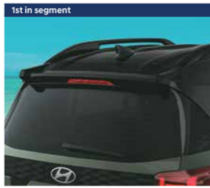
Painted black rear spoiler & roof rails