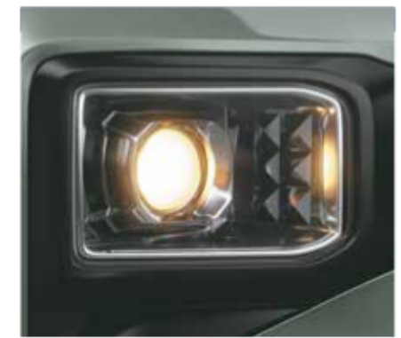
Projector bi-function headlamps