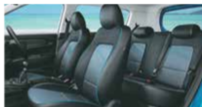
Cosmic blue inserts