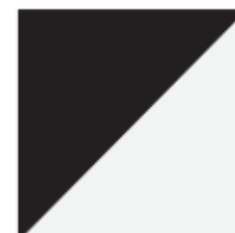
Atlas white with abyss black roof