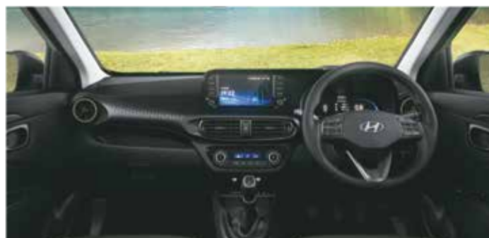
Black interiors with light sage inserts