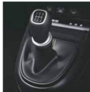
Manual transmission (MT)