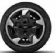
R15 (D=380.2mm) Dual tone styled steel wheel

All it takes is a look to know that Hyundai EXTER is for those who love to be outside. Be it the signature H-LED DRLs, EXTER branding on the front bumper, sporty bridge type painted black roof rails, dynamic painted black rear spoiler, everything makes Hyundai EXTER look spectacular and ready for outside.