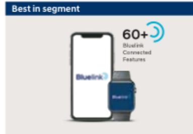
BlueLink connected car technology (Free for 3 years)