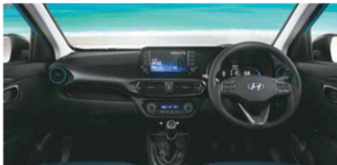
Black interiors with cosmic blue inserts